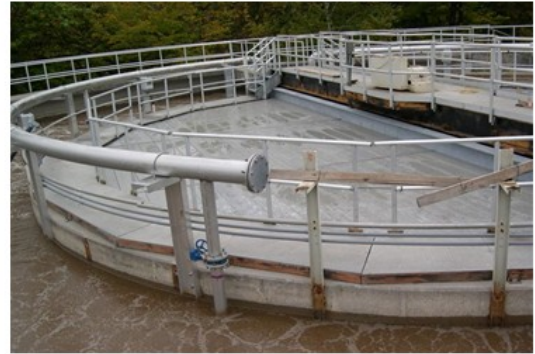
Pro'Deck Flat Cover