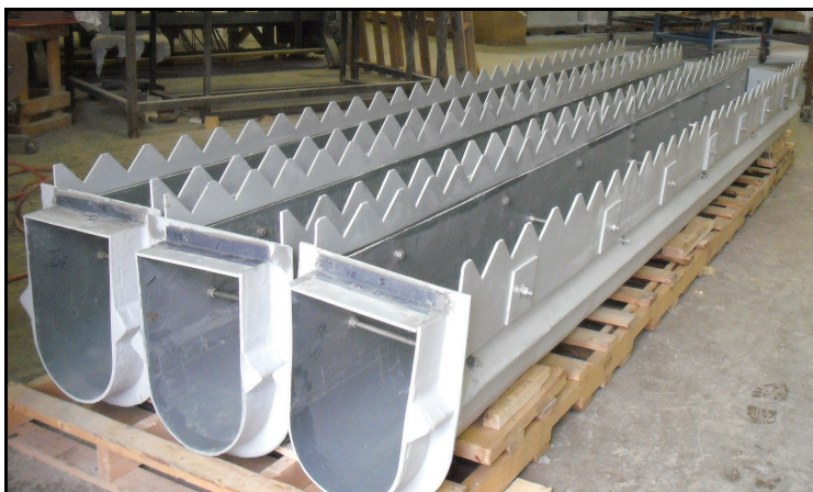
Troughs & Notched Weirs