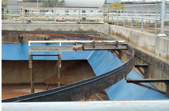
Density Current Baffles