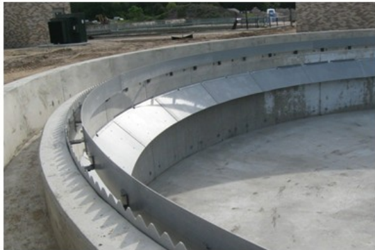
Weirs, Scum Baffles & Density Current Baffles