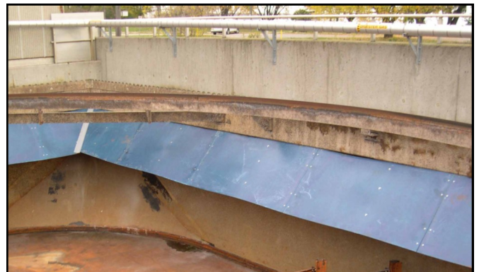
Density Current Baffles