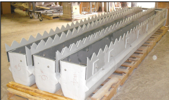
Troughs & adjustable Notched Weirs