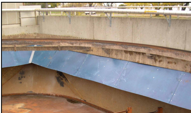
Density Current Baffles

The standard resin system is a cement grey polyester resin. Pultrusion components incorporate a corrosion resistant polyester surfacing veil on the outer surfaces and the cut edges are sealed at the factory. All products are available in fire retardant and various resin grades and color combinations upon request.