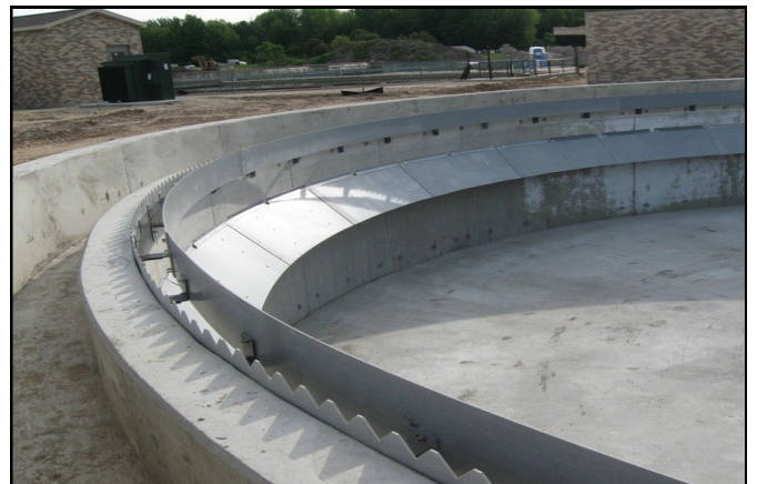
Notched Weirs, Scum Baffles and Density Current Baffles